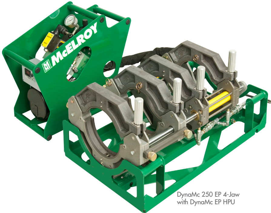
DynaMc 250 EP 4-Jaw with DynaMc EP HPU

Fusion Capability for 63mm - 250mm (2" IPS to 8" DIPS)